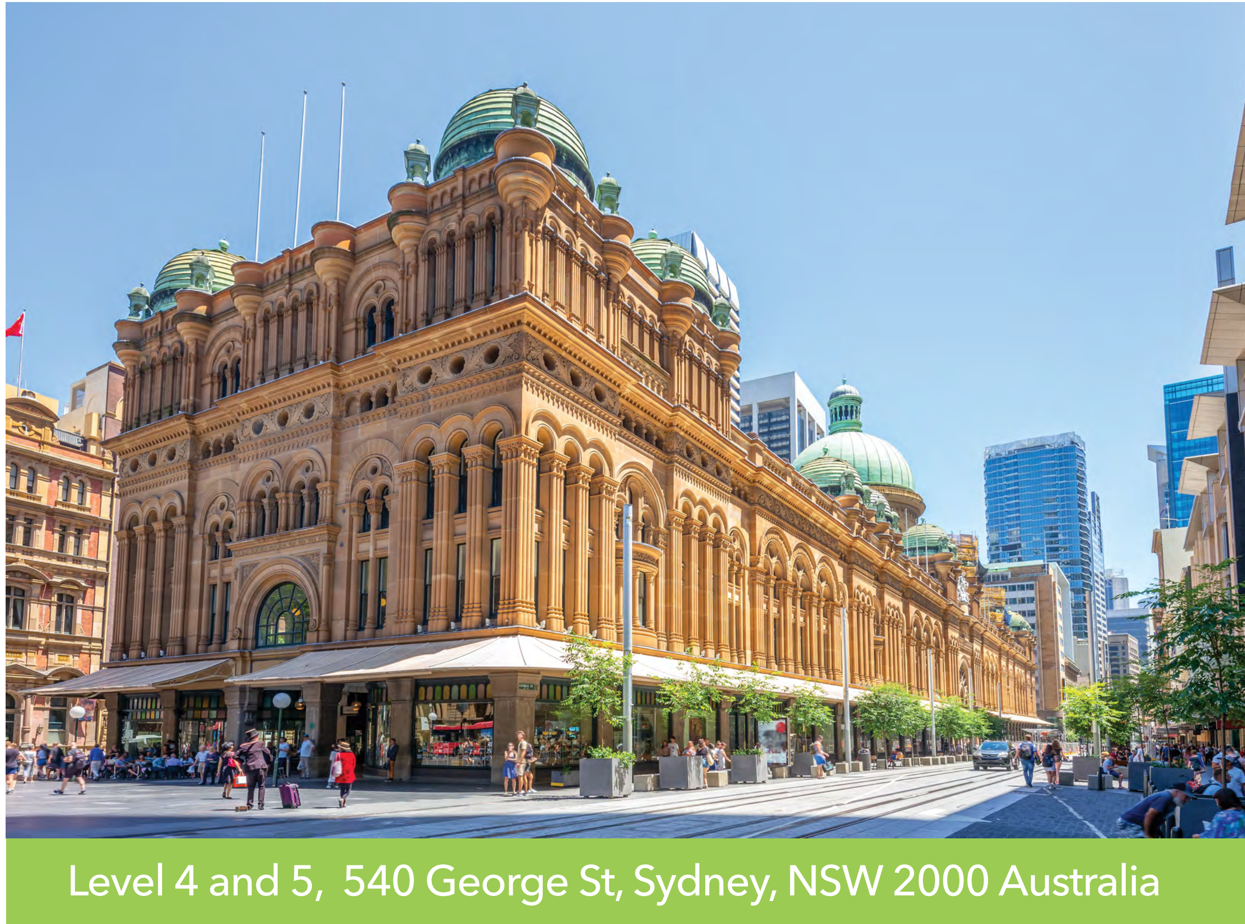
Level 4 and 5, 540 George St, Sydney, NSW 2000 Australia

International Graduate Institute Sydney Campus is centrally located and is adjacent to Town Hall, with trains, buses and light rail stops directly in front of the campus.